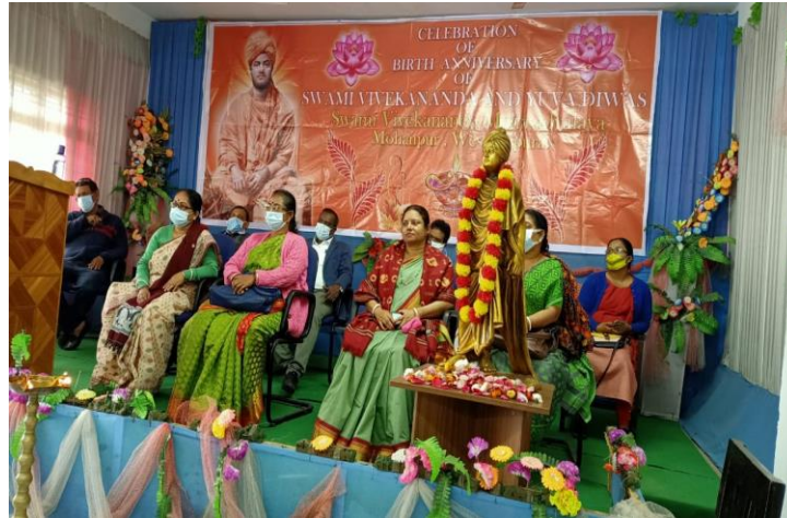
Swami Vivekananda Janma Jayanti (12/01/2022)

SVM celebrated Youth Day on 12 th January”2022, this year on occasion of Swamiji’s birthday. The event took place in the college seminar hall with students presenting many cultural activities like Singing, Dancing, poem recitation etc. And teachers giving inspiring speeches on Swamiji. In this occasion 212 students participated.