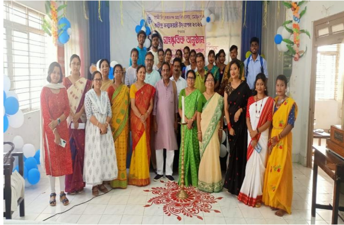
Glimpses of 161 st Birth Anniversary of Bishwakabi Rabindranath Tagore