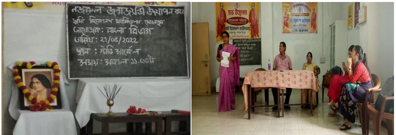
Glimpses of 123 rd Birth Anniversary of Bidrohikabi Kazi Nazrul Islam