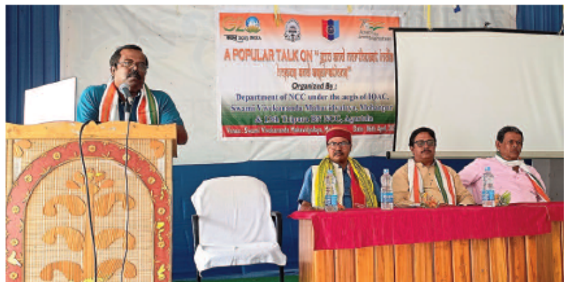
■ Discussion on "G-20 and Northeast India: hopes and aspirations" jointly organized by department of NCC at Swami Vivekananda Mahavidyalaya, Mohanpur and 13 Tripura Bn NCC on Thursday.