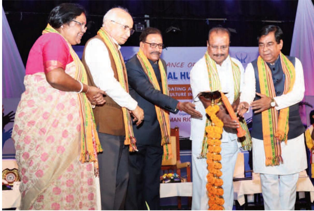
■ Governor Indra Sena Reddy Nallu inaugurates International Human Rights Day in Rabindra Satabshiki bhawan on Sunday evening in Agartala.